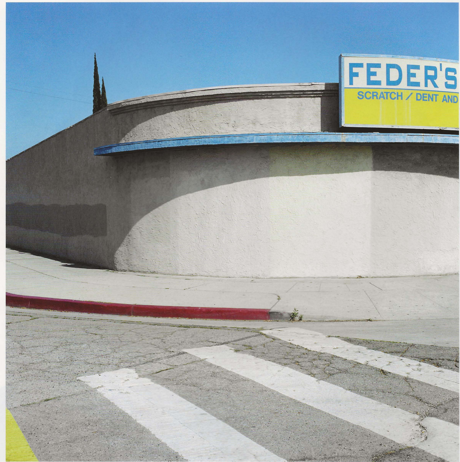
ABOVE Feder's, The Valley, 2015