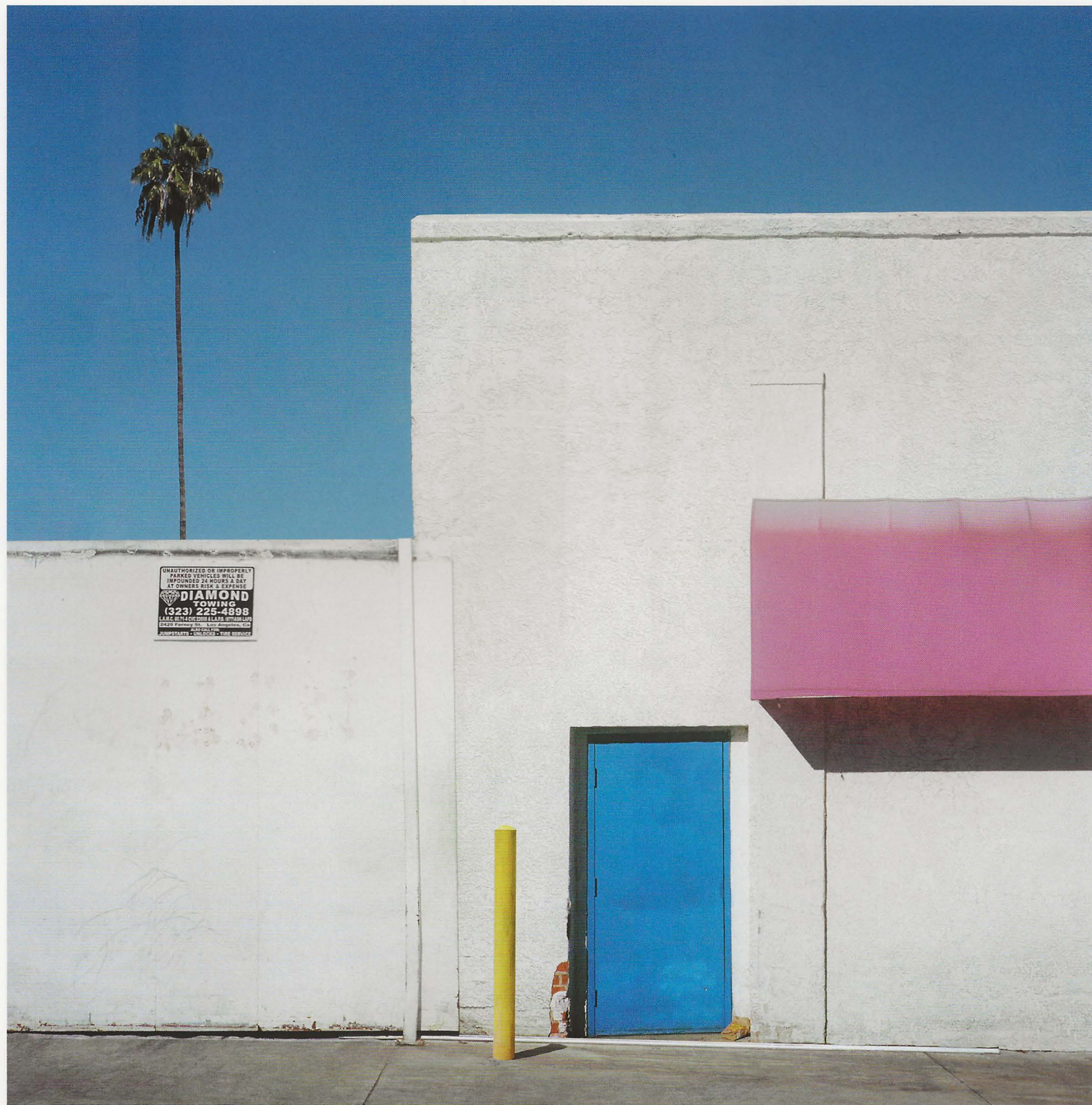
PREVIOUS PAGE Bank, Palm Springs, 2015