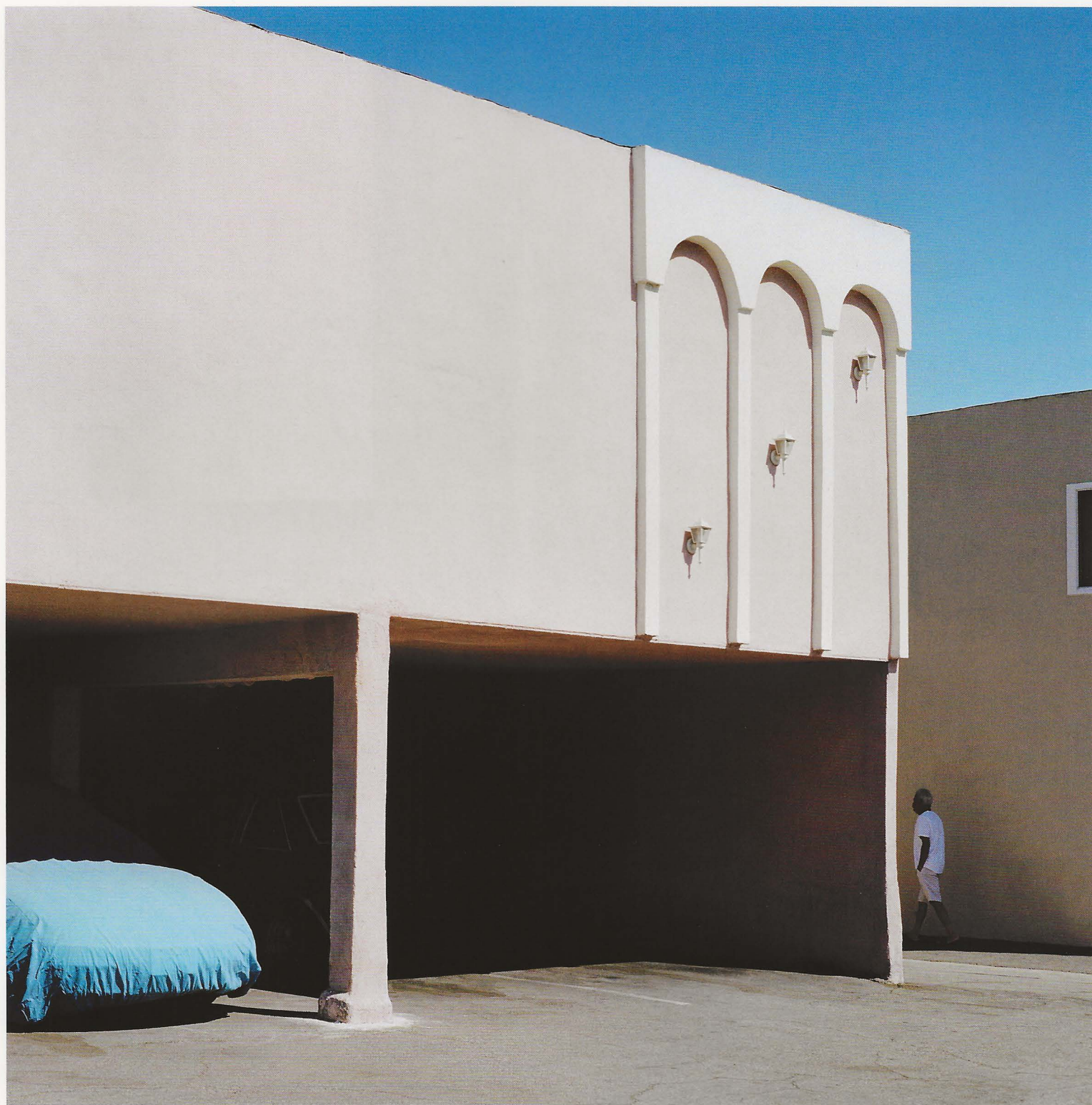
ABOVE Cahuenga, 2016