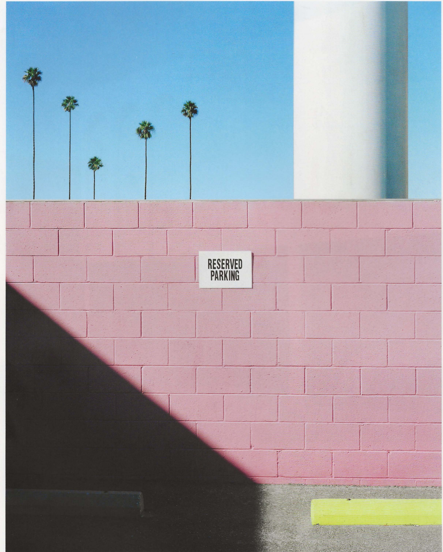
OPPOSITE East Hollywood Carpark, 2016