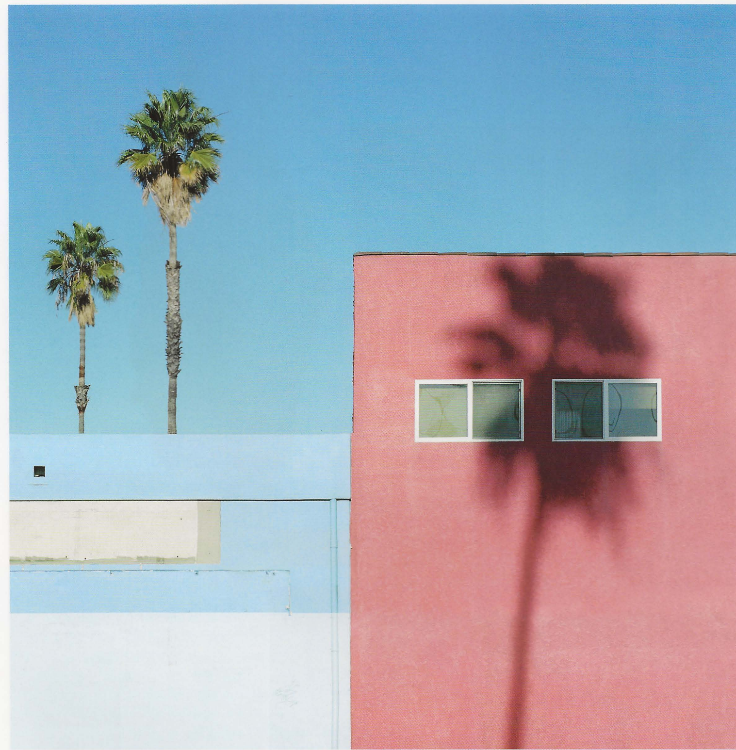
ABOVE El Chavo, 2016